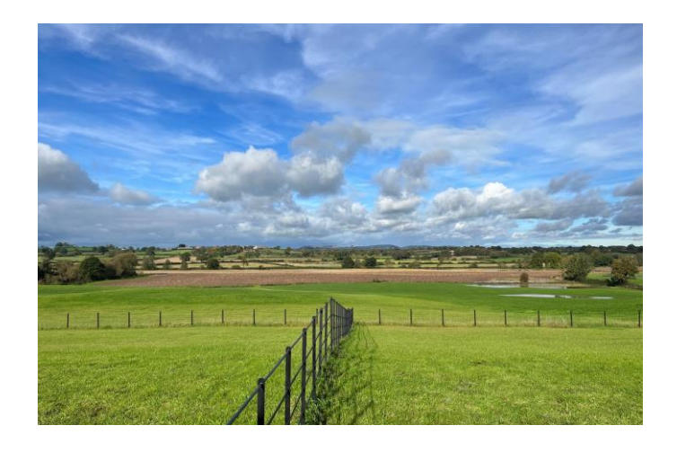
Services/Tenure Mains Water, Electricity, Shared Private Drainage / Freehold.